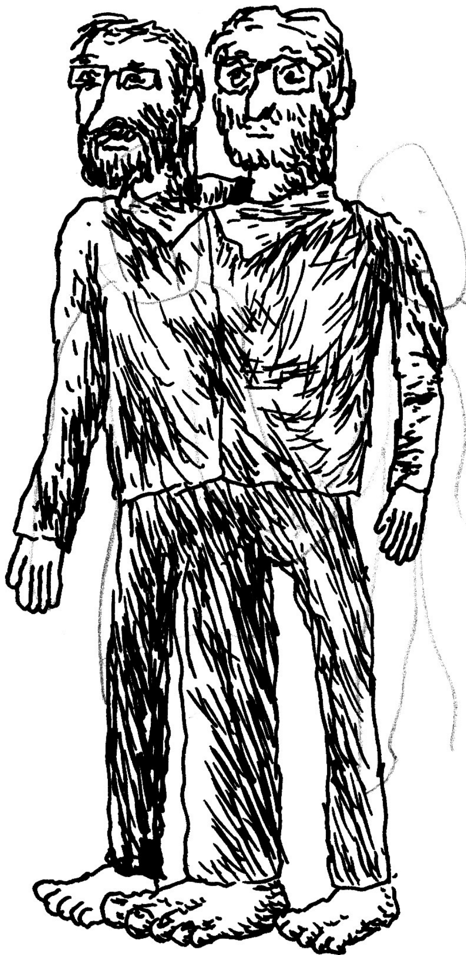
Atopic Bodies [TWO]: Sianoise Twins