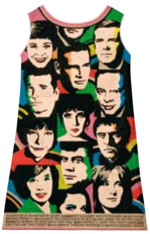
The Big Ones for '68 paper dress USA1968 Promotional paper dress of Universal Studios with "pop" portraits of the Studios popular stars.