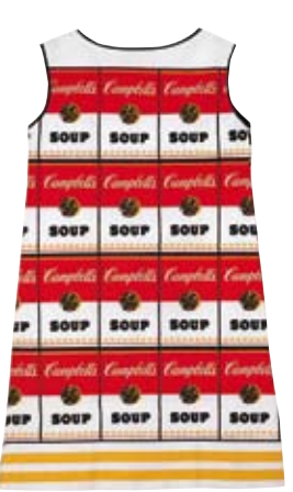
The Souper Dress, after Warhol, USA 1968 Launched by Campbell's Soup Company for the promotion of its Vegetable Soup.