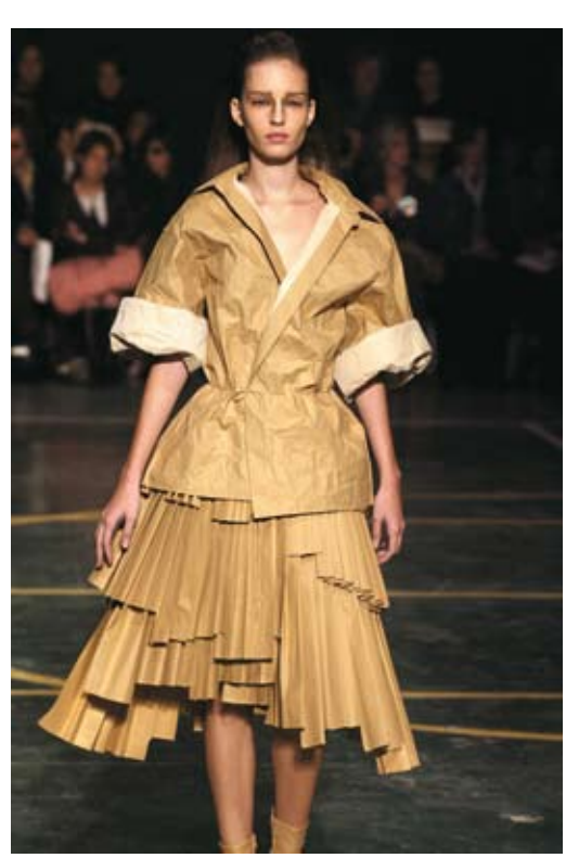
A.F. Vandevorst S/S 2004