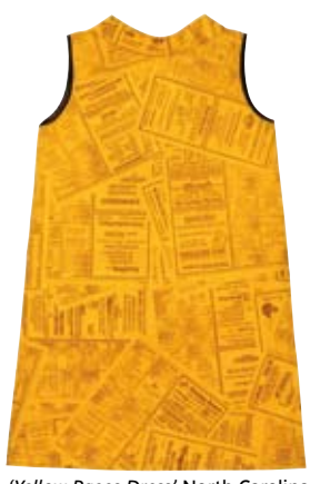
'Yellow Pages Dress', North Carolina 1968 Promotion dress of the Yellow Pages phone book with collage of its pages.