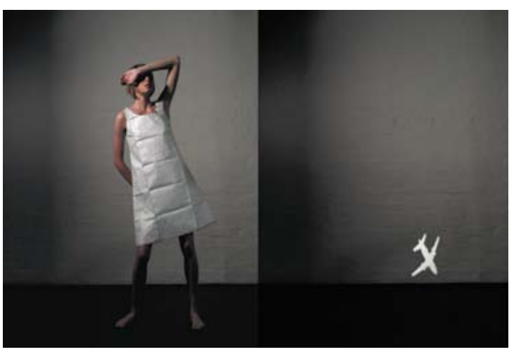
Hussein Chalayan, Airmail Dress, 1999 Private Collection