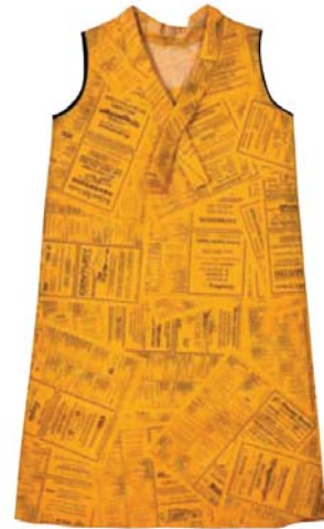
ATOPOS 2005.02.018 a Yellow Pages Dress. Dress by Mars Manufacturing Company, Waste Basket Boutique line. Asheville, North Carolina, c. 1968.