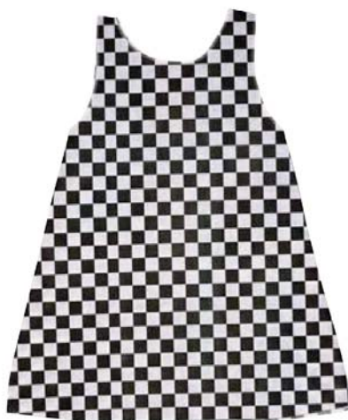
ATOPOS 2005.02.134a Dress by Promo Dress Company, Papershape line. Beverly Hills, California, 1966-1968. Conserved with the kind support of a Friend of ATOPOS.