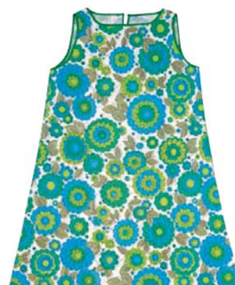
ATOPOS 2005.02.106a «Capri» Flower Fantasy. Cellulose - cotton mixture dress, by Hallmark Cards Inc., Party Fashions in Paper line. Kansas City, Missouri, c. 1967.