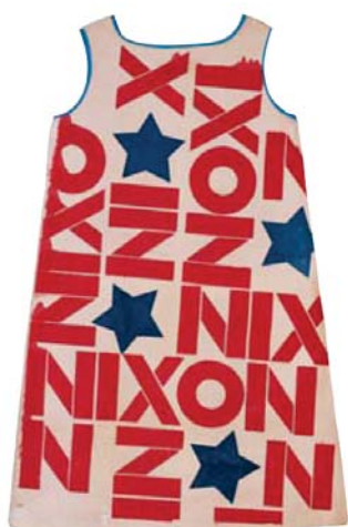
ATOPOS 2005.02.120 Richard Nixon's electoral campaign dress with logo. Manufactured by Mars Manufacturing Company, Waste Basket Boutique line. Asheville, North Carolina, 1968.