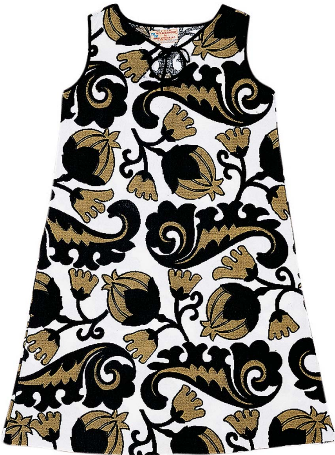
ATOPOS cvc 2005. 02. 162a