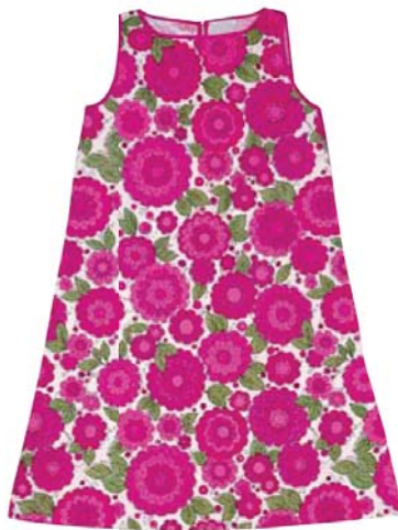
ATOPOS 2005.02.081a «Burgundy» Flower Fantasy. Cellulose - cotton mixture dress, by Hallmark Cards Inc., Party fashions in Paper line. Kansas City, Missouri, c. 1967.