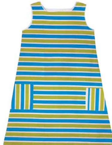
ATOPOS 2005.02.088a Kaycel dress, by Mars Manufacturing Company, Waste Basket Boutique line. Asheville, North Carolina, 1966-1967.