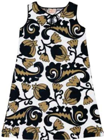
ATOPOS 2005.02.162 a The Paper Keyhole-Neck Dress. Manufactured by Mars Manufacturing Company, Waste Basket Boutique line. Asheville, North Carolina, 1967. Conserved with the kind support of a Friend of ATOPOS.