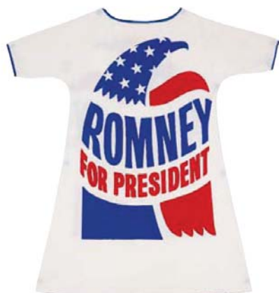
ATOPOS 2005.02.079 George W. Romney's 1968 U.S. election campaign dress with logo. Manufactured by Mars Manufacturing Company, Waste Basket Boutique line. Asheville, North Carolina, 1968.