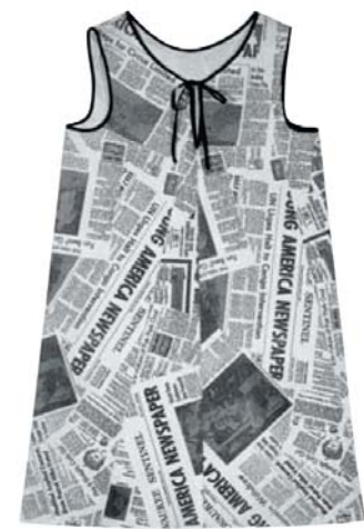
ATOPOS 2005.02. 084 Dress with collage of newspaper articles and first-page articles of the newspaper of the "young America", Milwaukee Sentinel, June- July 1967. USA, 1967-1968.