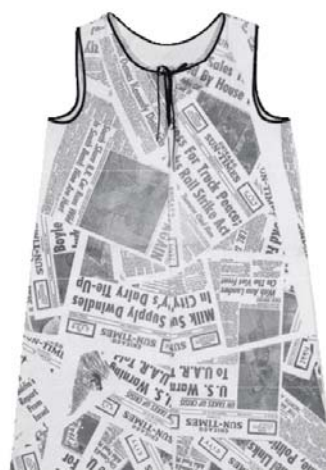
ATOPOS 2006.02.260 Cellulose - cotton mixture dress with collage of newspaper articles and first page articles of The Chicago Sun-Times. USA, c. 1967.