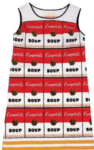
ATOPOS 2005.02.049 The Souper Dress. Cellulose - cotton mixture dress, by Campbell's Soup Company. New Jersey 1968. Conserved with the kind support of a Friend of ATOPOS.