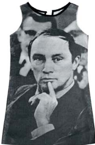
ATOPOS 2005.02.163 Pierre Trudeau campaign dress. Canada 1968. Conserved with the kind support of a Friend of ATOPOS.