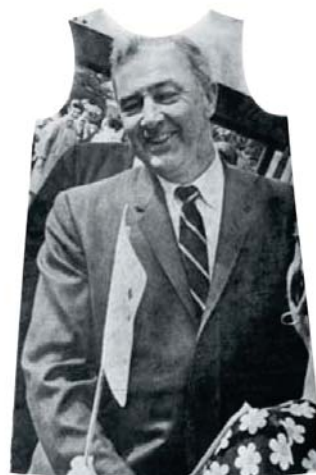
ATOPOS 2006.02.251 Election campaign dress with Eugene McCarthy's photo, by Mary Wear Inc., Candidress. USA, 1968.