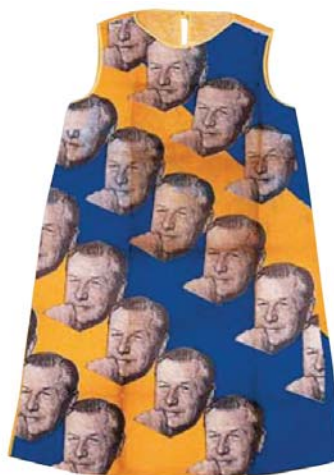
ATOPOS 2005.02.160 Nelson Rockefeller's electoral campaign dress with logo. Manufactured by James Sterling Paper Fashions Ltd. New York 1968.